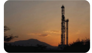
Energy, Petroleum and Extractive Industries