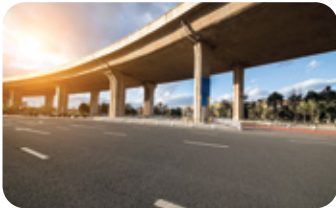
Projects & Infrastructure