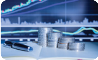
Financial Services (Banking Insurance & Fund Management)