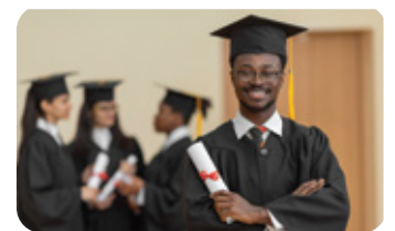
Education, Research & Development