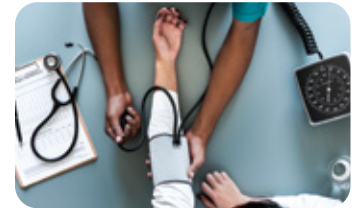
Healthcare & Pharmaceuticals