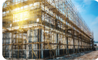
Construction & Real Estate