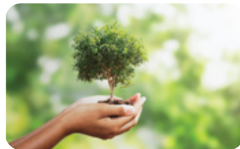
Environmental & Biodiversity Conservation