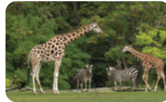
Hospitality & Tourism