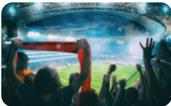
Entertainment & Sports