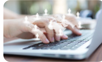
Information, Communication & Technology (ICT)